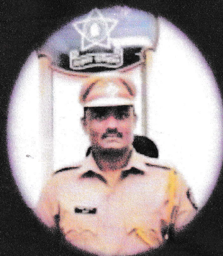
Shri Rahul Madane Deputy Commissioner of Police Zone - 2 Nagpur City , Nagpur