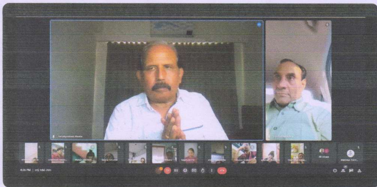
Chief Guest Remark on the Valedictory Function