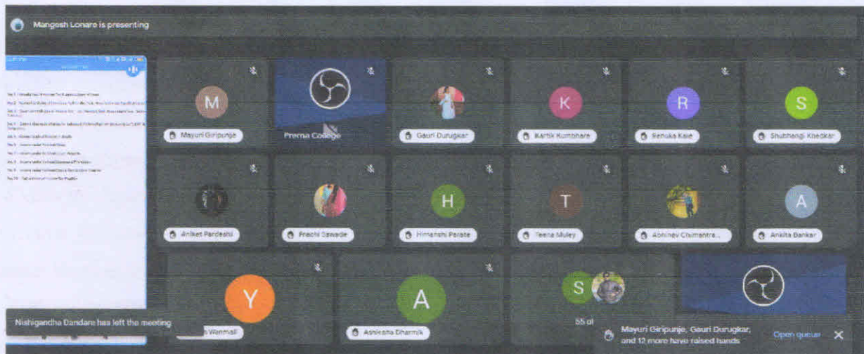
Addressing the students through PPT