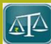
Akash Business Tool