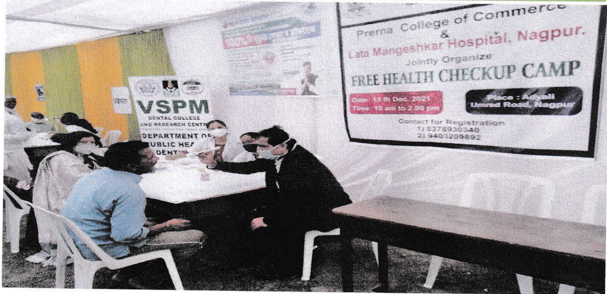
Dentist physically examine the patient and give suggestion according to their health issues.