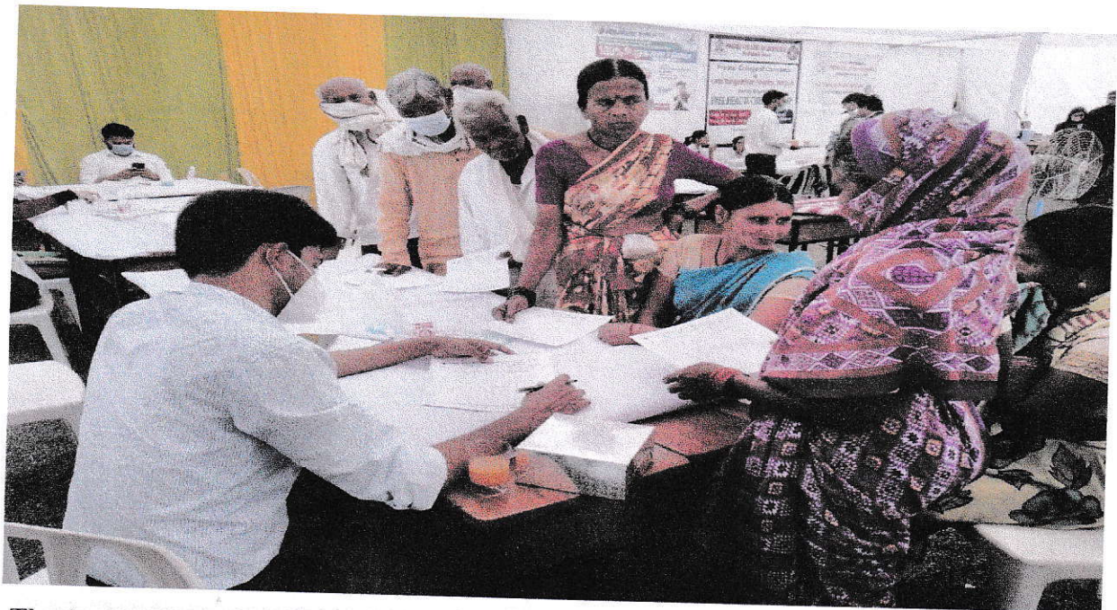
The doctor physically examining the patients and give suggestion according to their health issues.