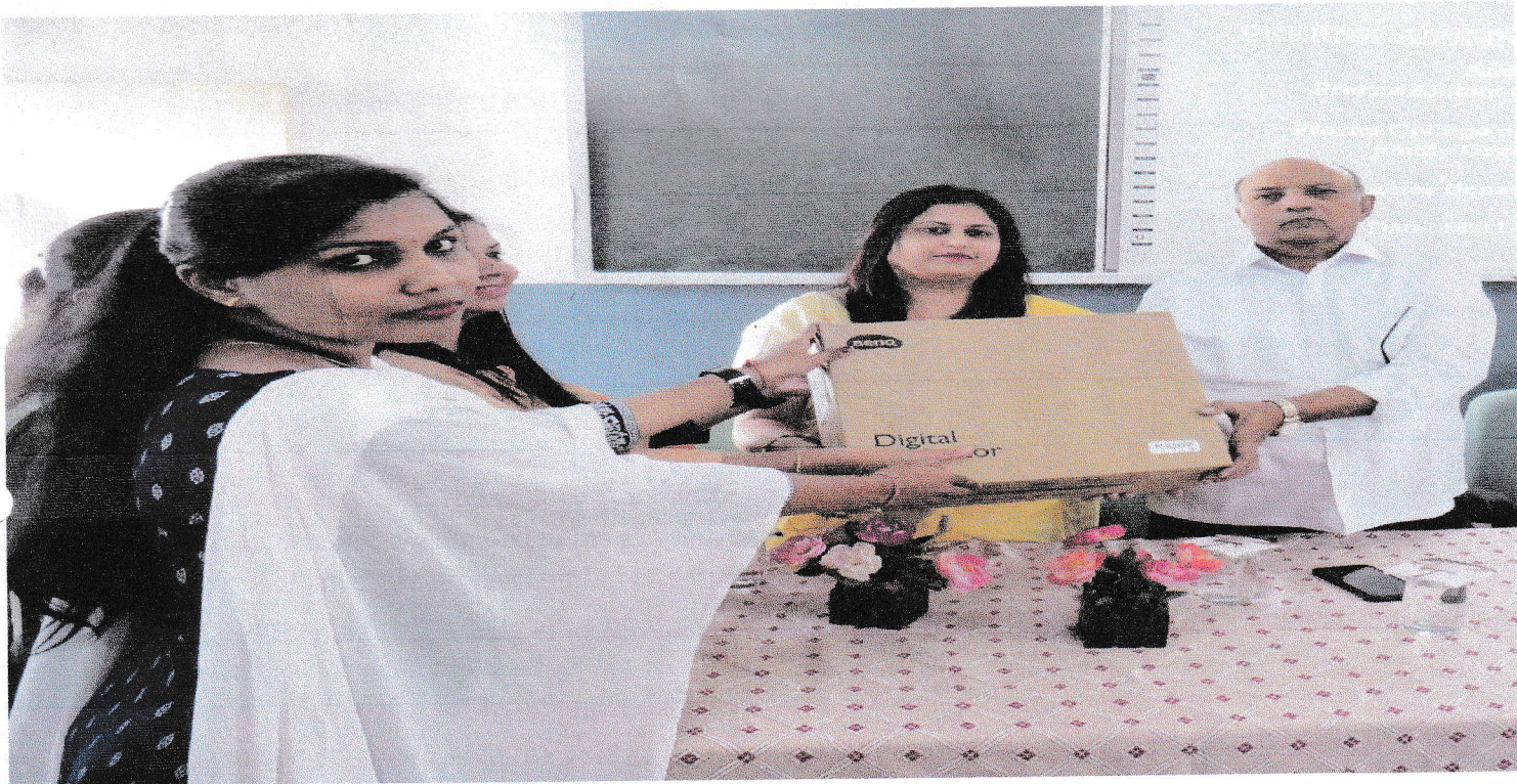
Member of Alumni Association donating LCD Projector