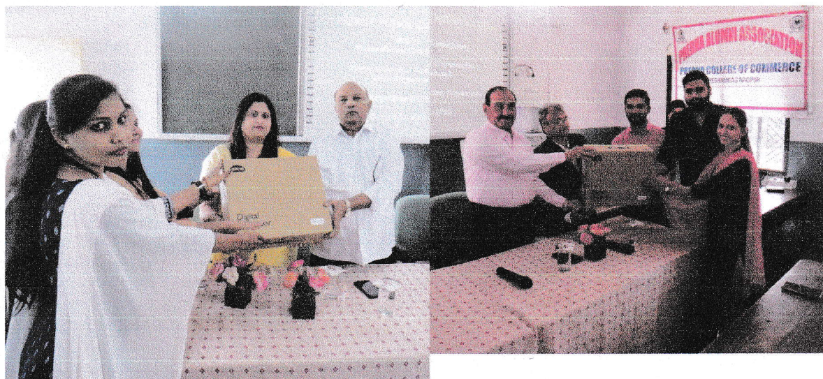
Members of Alumni Association donating the projectors.