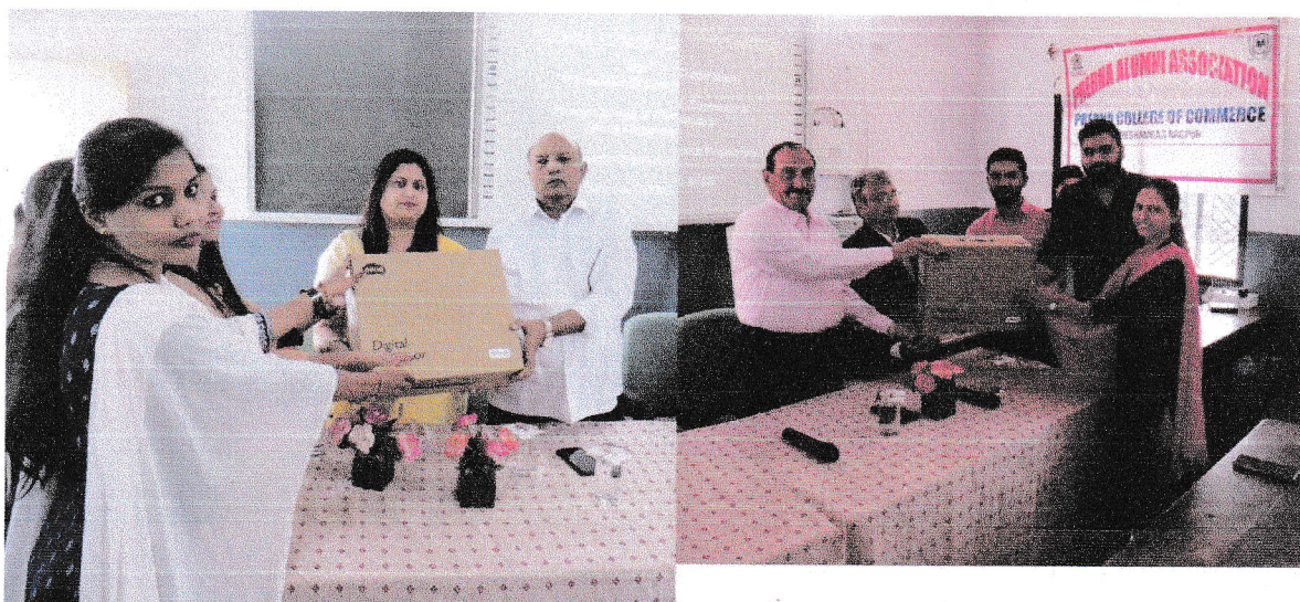
Members of Alumni Association donating the projectors.