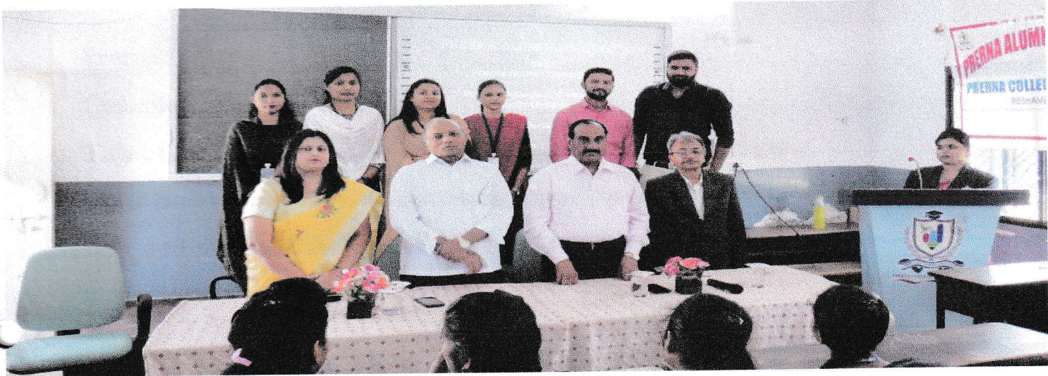
➤ All students and teachers