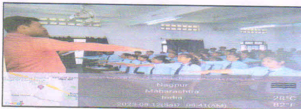
Students taking the pledge