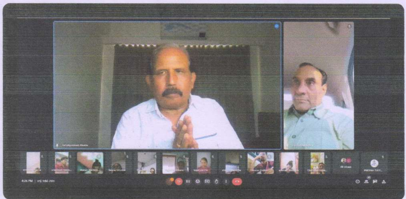
Chief Guest Remark on the Valedictory Function