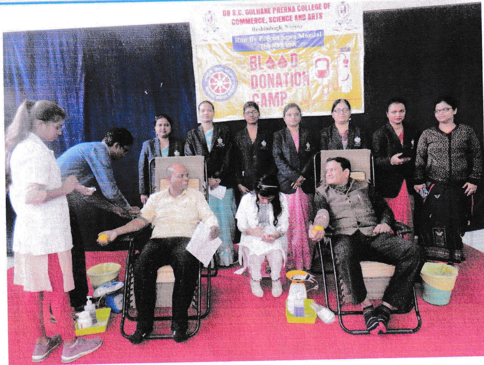
Blood Donation by Faculty