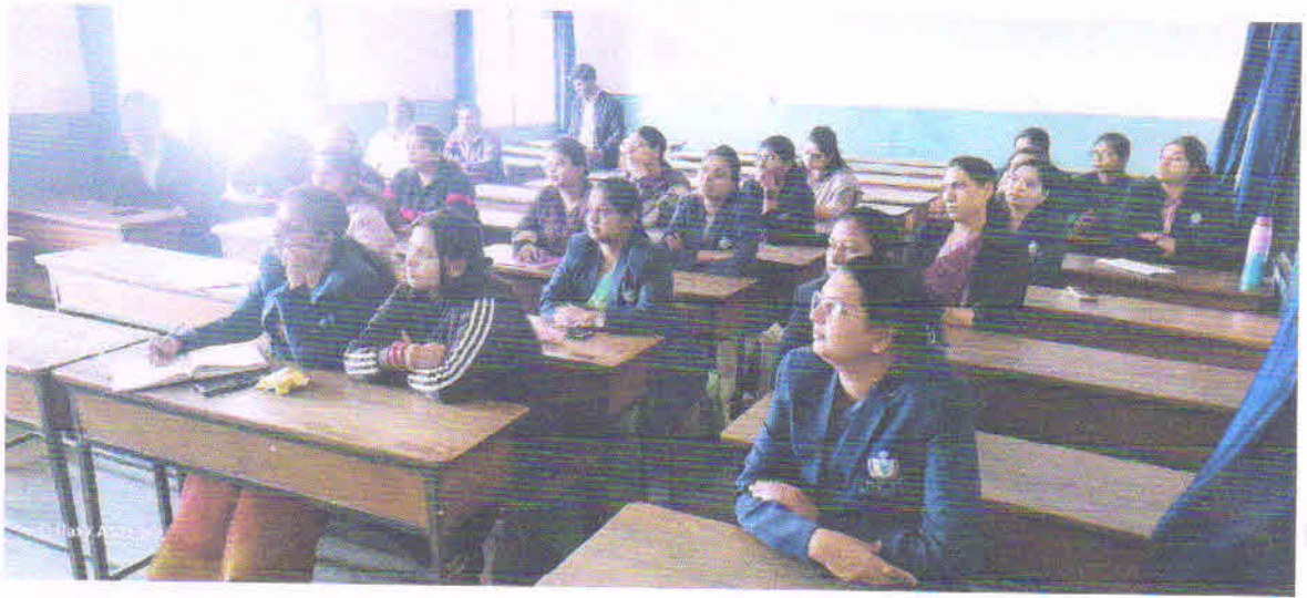
Faculty members attending a seminar on data analysis.