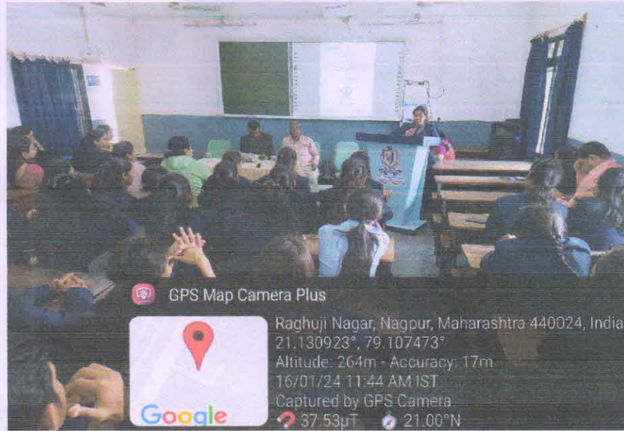
Ms Sakshi Shivhare proposed a vote of thanks