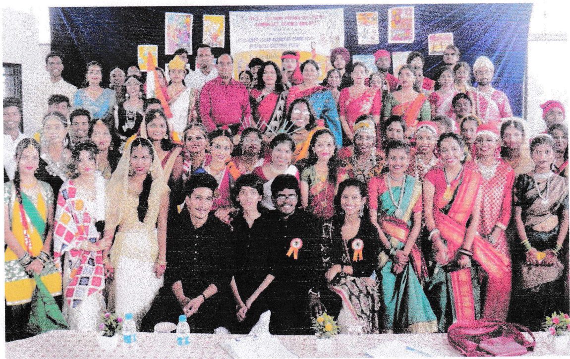
Group photo with all the Incredible India fashion show participants