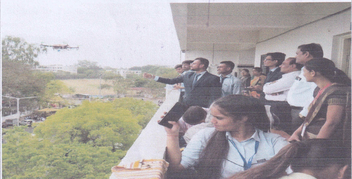
Model Making Competition