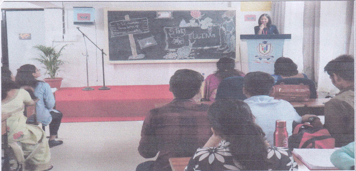
Story Telling Competition