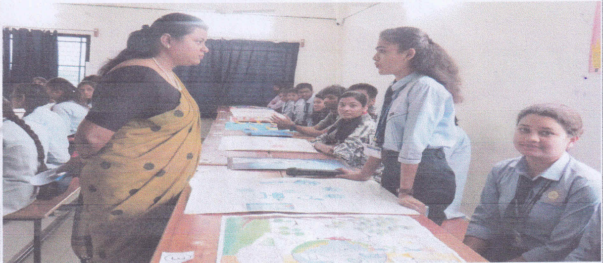
Poster Making Competition