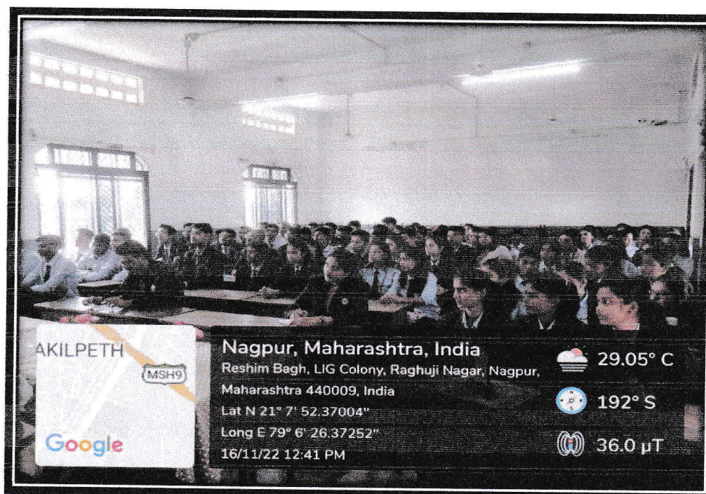
Students' Participation in seminar