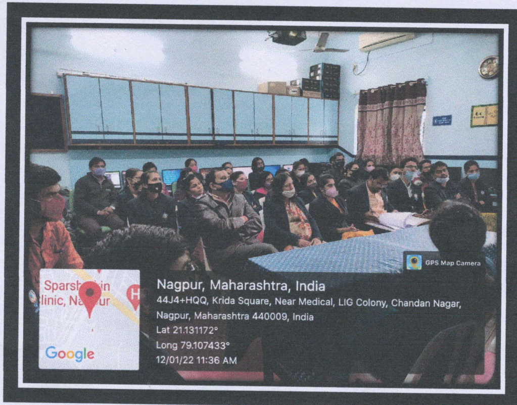
All the Staff attending the seminar