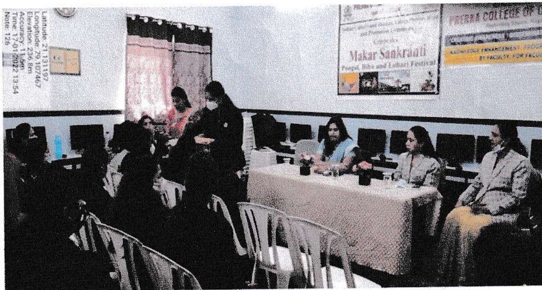
Lady faculty giving Haldi Kumkum to each others.