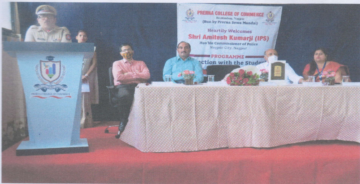
Shri AmiteshKumarji (IPS), Hon'ble Commissioner of Police, Nagpur, addressing the students and faculty members