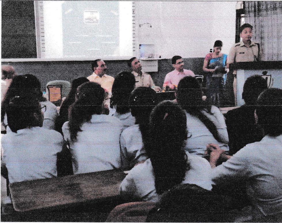
Mr Noorul Hasan, Deputy Commissioner of Police, Zone - IV, Nagpur, addressing the students.