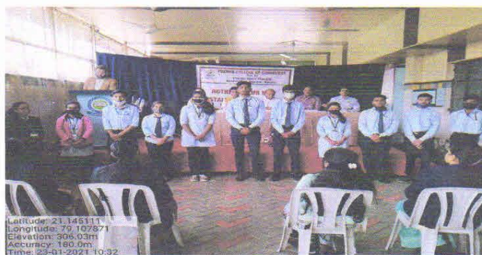
All the Executive Body Members of Rotaract Club members with the Guests.

Latitude: 21.145111 Longitude: 79.107871 Elevation: 306.03m Accuracy: 180.0m Time: 23-01-2021 10:32