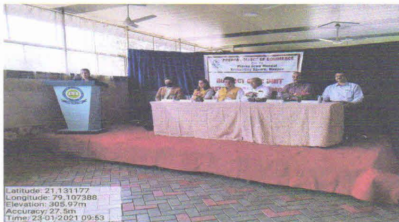
The Inaugural Ceremony of Rotaract Club Unit in Prerna College of Commerce