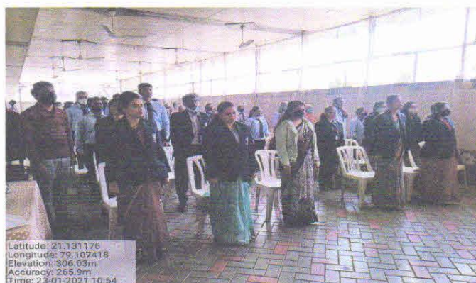
All the executive body members taking pledge for being the part of the Rotaract Club Unit.

Latitude: 21.131176 Longitude: 79.107418 Elevation: 306.03m Accuracy: 265.9m Time: 23-01-2021 10:54