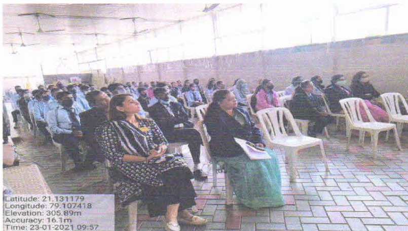
All the faculties and student members of Rotaract Club Unit present on the program.