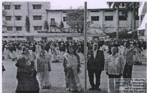
All the dignitaries were present on the occasion of Flag unfurling ceremony.