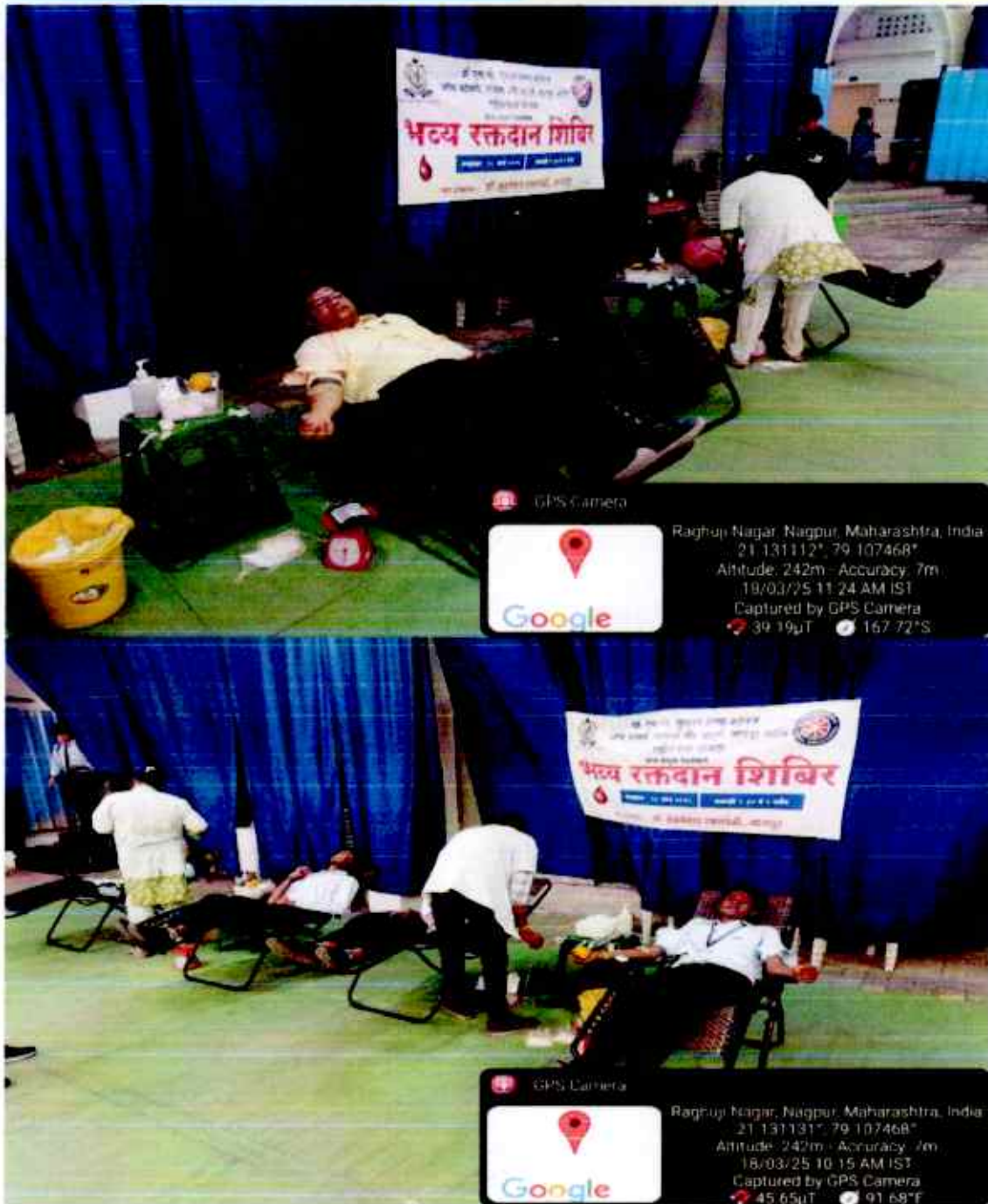
Blood Donation by Faculty and Students