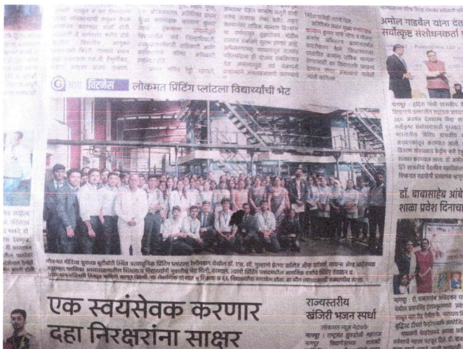
Lokmat Group self-published News of Visit in their News-Paper on Eye-Witnessed Page