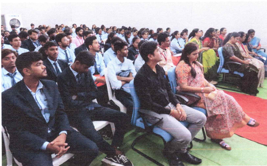
Inauguration is attended by the Participant of the Certificate Course