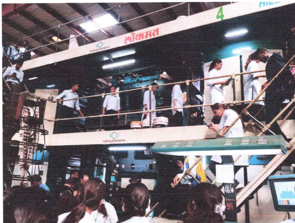
Students looking at the Printing Machinery